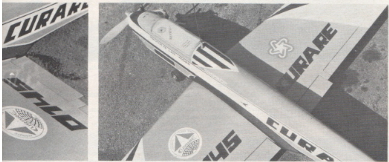
Left: fuselage (L) and the combination flap/brakes (R).

FULL SIZE PLANS AVAILABLE . . . SEE PAGE 84