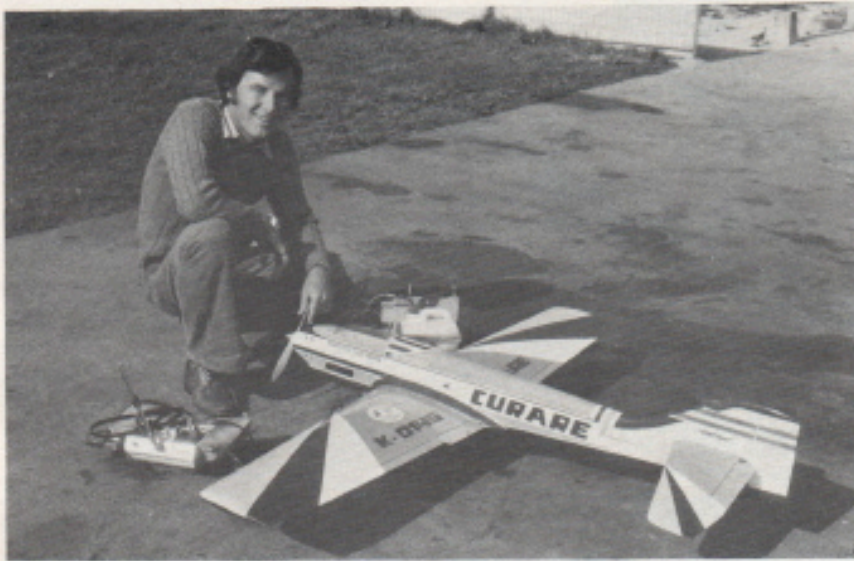
Prototype of the Curare that won the 1975 Tournament of Champions and the $10,000 award.