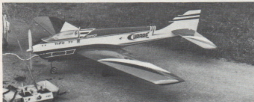
Another view of 1977 machine which is finished in its usual fine manner, very colorful.

• We feel that the ultimate model design for international R/C aeromodeling competitions is the Curare. An extensive amount of research and testing has been accomplished over the last few years to develop the Curare design into what it now is. Our previous design, Super Sicrolly II, is the basis of the Curare. Several design parameters of the Sicrolly design have been retained, notably the elegance with which maneuvers can be performed. The Curare features improved crosswind performance and extreme smoothness in gusty high wind conditions. There is very little difference flying the Curare in windy or calm conditions. A pilot can fly the model through the FAI program or any other combination of maneuvers and not have to worry about correcting every maneuver, leaving time to perform exact maneuvers.