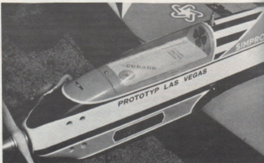
Two close-up views of the Las Vegas Prototype showing engine mounting bolt holes through