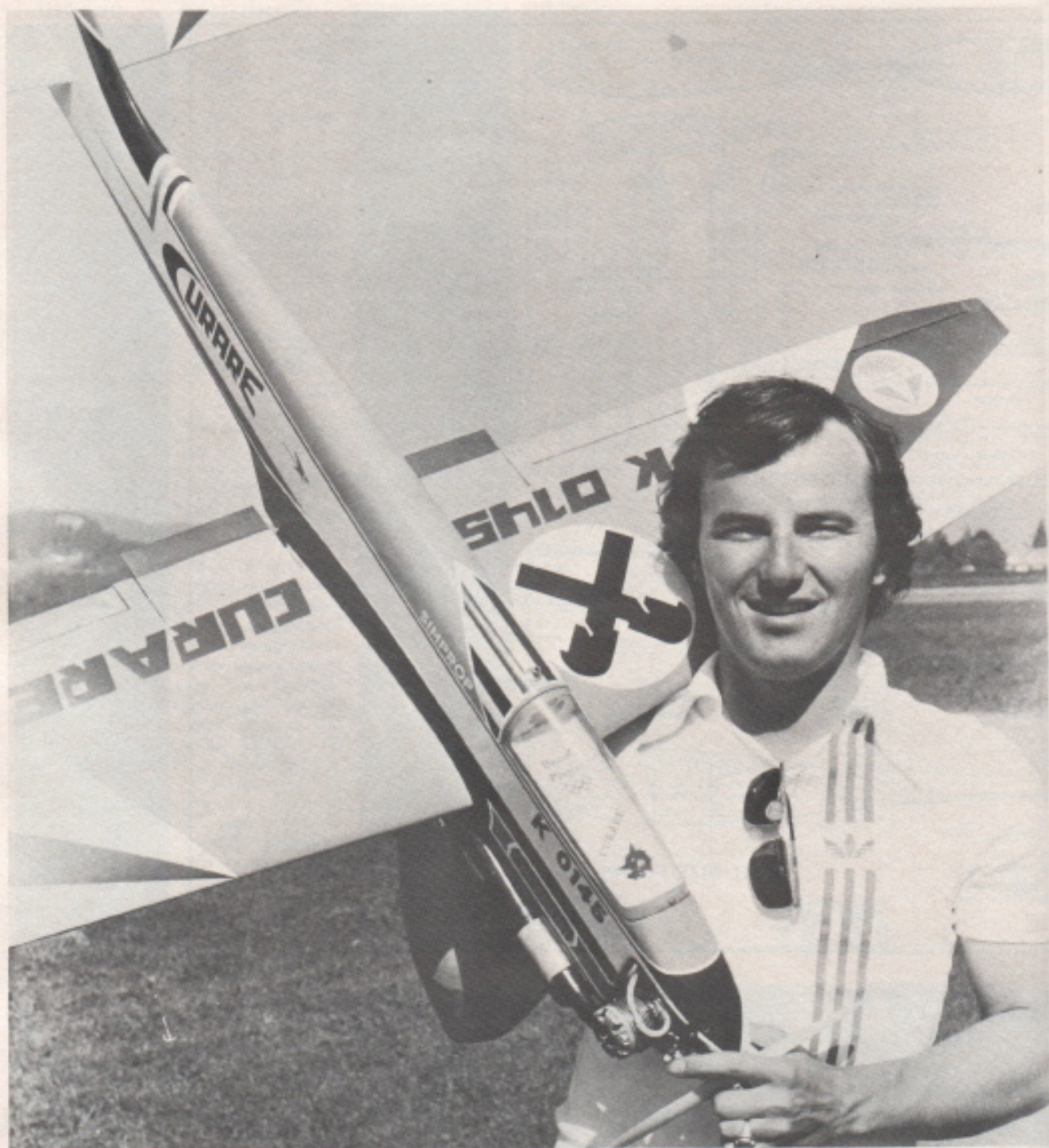
Handsome pilot with his equally handsome and very colorful Curare. Note the Webra pipe.