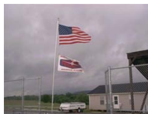
Old Glory and RCRC flags respond to 30 MPH winds.